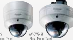
WW-CW240S (Surface Mount Type)

WW-CW500S (220-240 V AC) WW-CW504S (24 V AC or 12 V DC) WW-CW504F (24 V AC or 12 V DC)