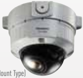
(Surface Mount Type)

WW-CW500S (220-240 V AC) WW-CW504S (24 V AC or 12 V DC) WW-CW504F (24 V AC or 12 V DC)